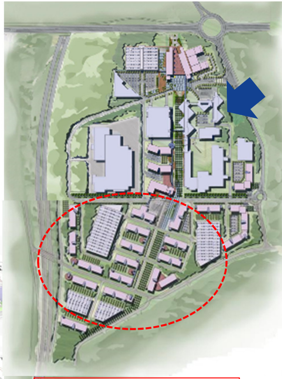
Development plan for southern land (mix residential and office buildings)